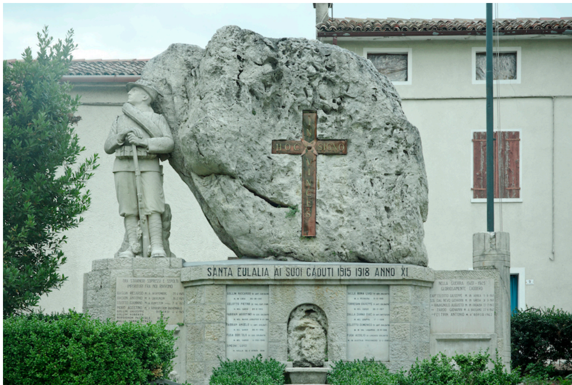
Figure 12. Monument to the Fallen, Sant'Eulalia, 1933

In his important study on the cult of saints, Peter Brown noted how – differently from both pagan and Jewish sensibilities – early Christianity began to perform its ceremonies in places where saints were actually buried. The tomb of a single individual thus became the focal point of forms of worship that extended to the entire community. Another unique feature of Christianity was the use, when necessary, of practices such as exhumation, transfer, and dismemberment of the bones of the dead. It is in this way that a “grid of shrines” began to mark the Christian Mediterranean and the Middle East (Brown, 1981, p. 11). One of the main practices of the new religion also emerged from this development: pilgrimages not only to the tomb of the saint, but to locations connected with them, even if only for the presence of objects they had touched (Brown, 1981, p. 88). It was not only the faithful that flocked toward relics, but it was also the relics themselves that began to spread across the territory and make their way toward the faithful. The advancement of Christianity thus became increasingly more widespread and far-reaching (Brown, 1981, p. 120).